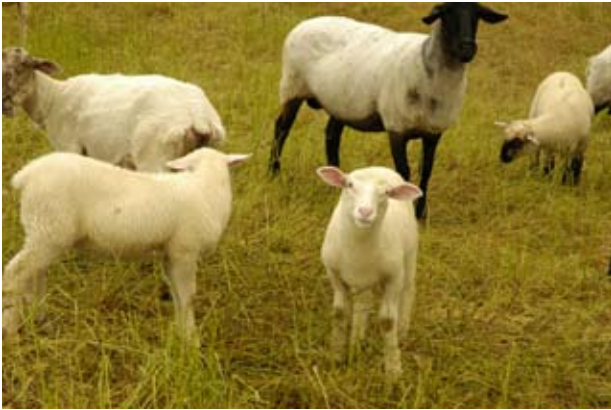
Lambs from Bluff Valley Farm.