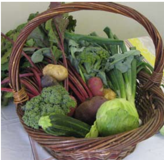
A basket of local food from a Community CROPS garden

For more information, call 474-9802 or visit www.communitycrops.org