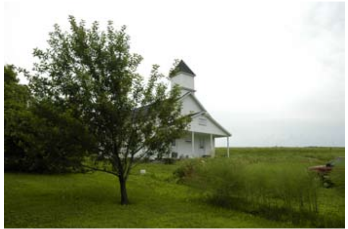
Thiltges are remodeling a schoolhouse for an on-site farm store near Rulo.

grains for animal feed. We visited the century old country schoolhouse Ken is in the process of remodeling into his very own at-home store.