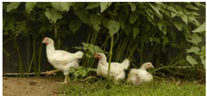
Plum Creek Farm raises chickens for Open Harvest.

We extend our thanks to both Bluff Valley Farm and Plum Creek Farm for their generous hospitality.