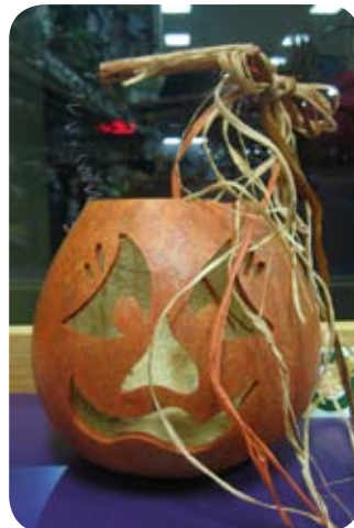
"RAFFIANA" mona callies