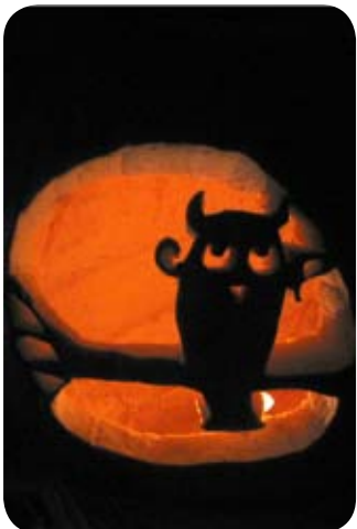
"HOOTY THE CO-OP OWL" brent schmoker